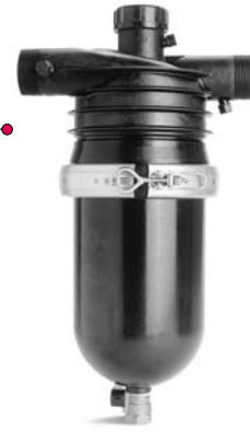
2" Super Filter